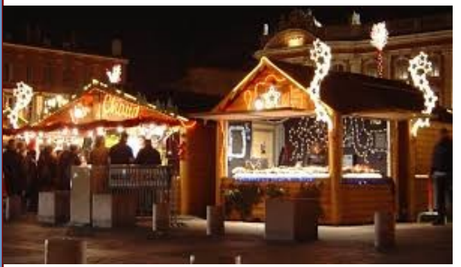
Take a look at our recipe book for traditional Christmas dishes and sweets!

In several Cilento villages Christmas markets are organized in December. They are an opportunity for the locals to show their handicraft products, such as ceramics, tools and sculptures in wood, stone and iron, or woven baskets, embroidery or food products and preserves. They are a good opportunity to try the many typical foods and dishes. In Castellabate the Christmas markets have a special, magical atmosphere that takes you back in time!