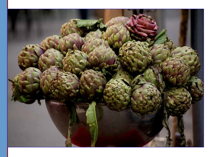
Take a look at our recipe book for dishes based on artichoke!

May is a month full of sports, folklore and culinary events. Keep an eye on www.calendarioeventinelcilento.it and choose your destination day by day, but don't forget that May is the artichoke month. It is one of the typical products of Cilento. Artichokes are the main food cultivated in the areas of Paestum and Pertosa.